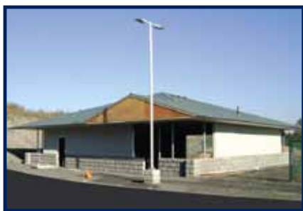
Doggie Day Care