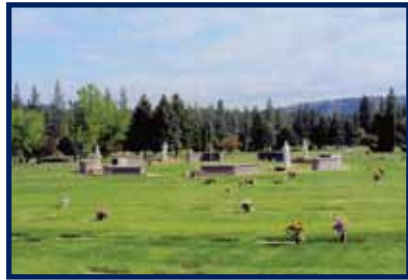
Spokane Memorial Gardens 509-448-2620