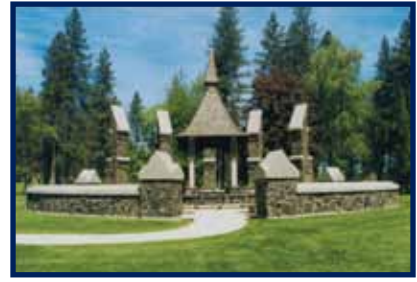
Riverside Memorial Park 509-838-1405