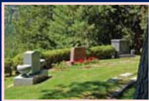
Memorialization Preplanning Pg.4