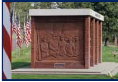
Greenwood Memorial Terrace 509-838-1405