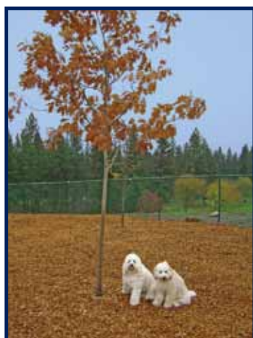
Finnean & William

The 1.3 acre off-leash dog park offers free Wi-Fi, fresh drinking water, and custom dog playground equipment in a well lit and secured fenced environment. Biodegradable doggie waste bags will be available at the separate entrances to the small breed area