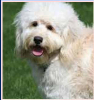
Pet Haven Park Update Pg.2