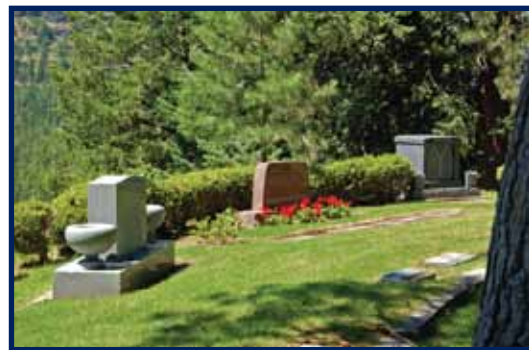
Monuments Fairmount Memorial Park