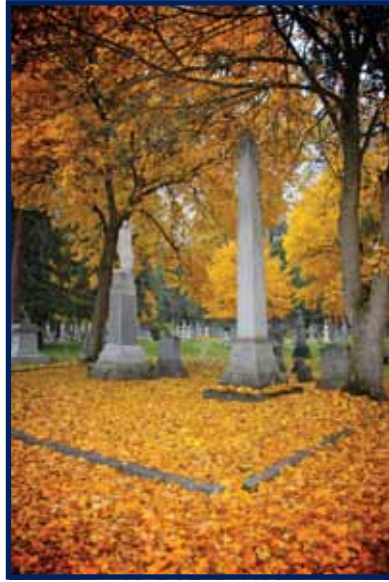
Fairmount Memorial Park