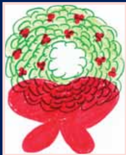
Cards For Our Troops Pg.7