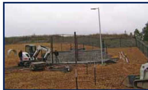
Outdoor Gazebo Construction

and the large breed area. Comfortable sitting areas are scattered throughout the park, as well as a covered outdoor gazebo where our 2 and 4 legged friends can gather to socialize or just relax.