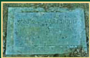
Historic Marker pg. 4