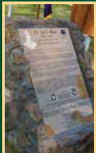
Joe E. Mann Monument pg. 2