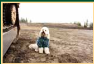
Pet Haven Update pg. 5