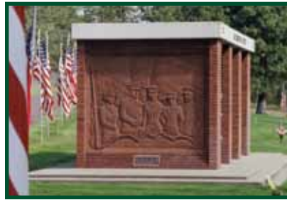
Greenwood Memorial Terrace 509-838-1405