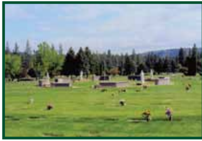
Spokane Memorial Gardens 509-448-2620