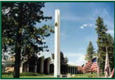
Fairmount Memorial Park 509-326-3800