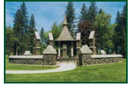
Riverside Memorial Park 509-838-1405