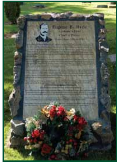
Eugene B. Hyde Monument

A decade later, Fairmount Memorial Association and the Spokane Law Enforcement Museum History Book Committee partnered with the intention of dedicating three historic monuments each year to tell the stories of Spokane's pioneers and police chiefs.