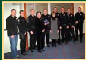
Hometown Heroes pg. 7